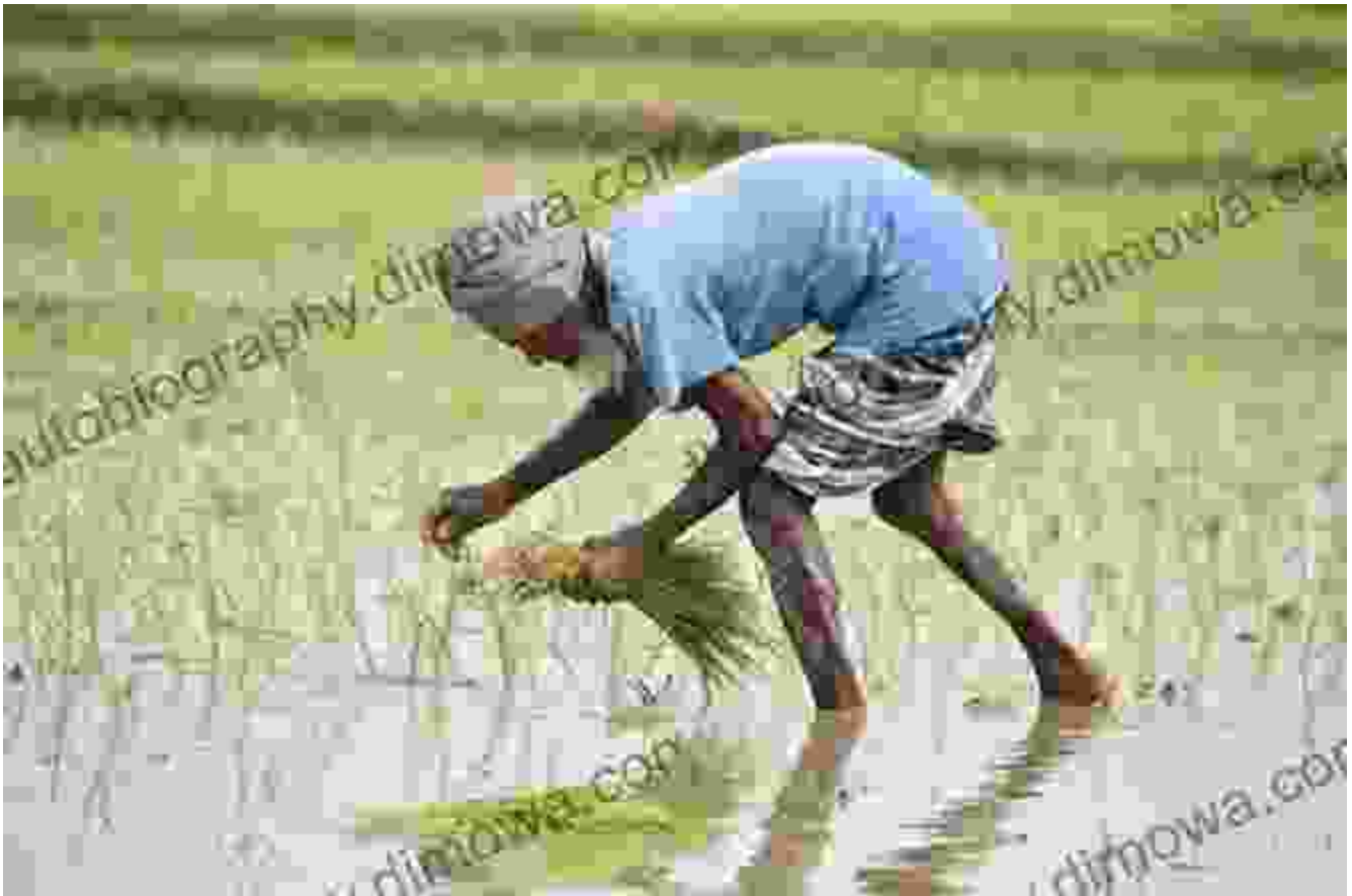
Caption: A Bangladeshi farmer working in a flooded field, a common sight during the monsoon season.

While water is essential for life, it can also pose challenges in Bangladesh. The country is prone to floods and cyclones, which can cause widespread damage and displacement. However, Bangladeshis have developed innovative ways to cope with these challenges, such as building traditional stilt houses and creating flood shelters.