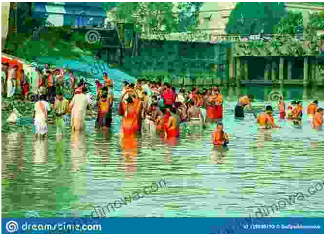
Caption: Devotees bathing in the Ganges River, a sacred ritual for Hindus.

Water plays a sacred role in Bangladeshi religious practices. In Hinduism, the Ganges River is considered holy, and devotees flock to its banks to bathe and perform rituals. Muslims use water for purification before prayers, and there are numerous bathing places (ghats) along the rivers. For Buddhists, water represents purity and compassion, and it is used in various ceremonies and festivals.