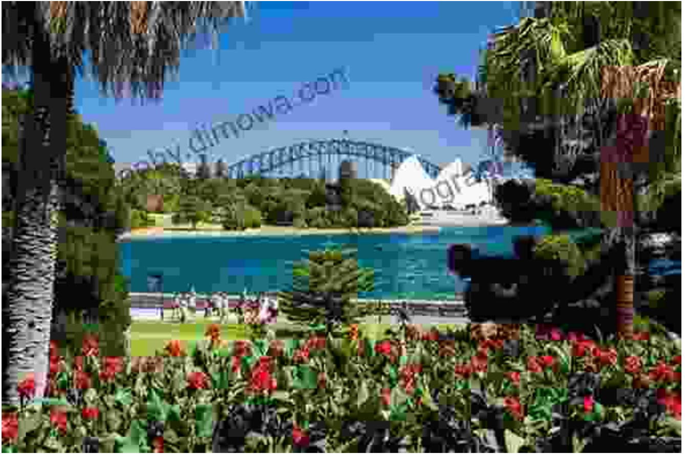
Royal Botanic Garden