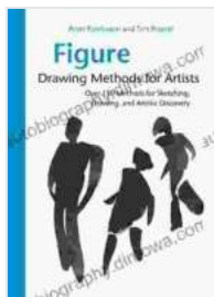
Figure Drawing Methods for Artists: Over 130 Methods for Sketching, Drawing, and Artistic Discovery

Within the pages of this captivating book, you will uncover a treasure trove of over 130 innovative methods that will ignite your imagination and elevate your creativity to new heights. Whether you're a seasoned artist or just beginning your artistic adventure, this book is your passport to unlocking the boundless possibilities that lie within the realm of visual art.